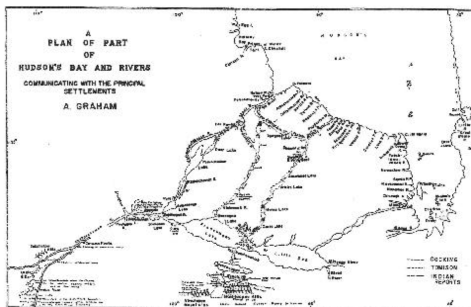
Figure 3. Saswaus House on Andrew Graham's map.